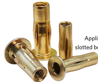
Applifast stocks slotted body inserts

Composite body to eliminate scratching and marring of material surfaces.