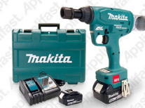
Huck BV4500 Adjustable Pull Force Battery Tool BV4500-118K2