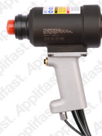
Huck 3585 Bobtail Hydraulic Installation Tool 3585