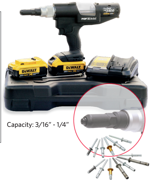
Capacity: 3/16" - 1/4"