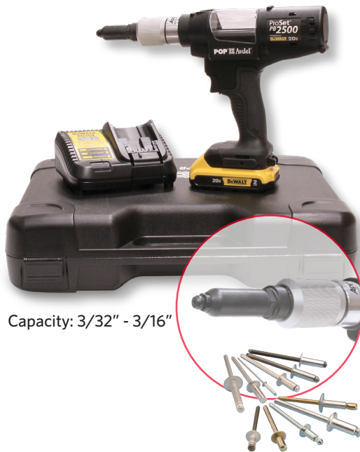
Capacity: 3/32" - 3/16"