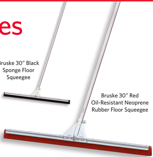
Bruske 30" Red Oil-Resistant Neoprene Rubber Floor Squeegee