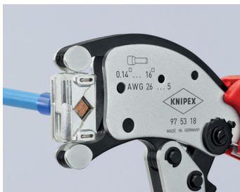
Crimp end sleeve (ferrules) fully automatically within the capacity of each tool