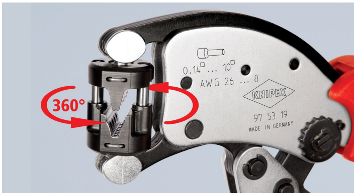
Rotating crimping head for optimal accessibility, even in confined areas