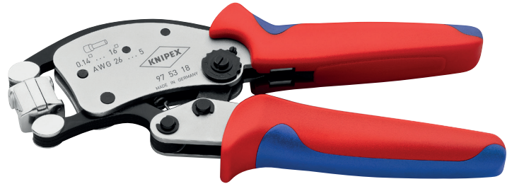
97 53 18