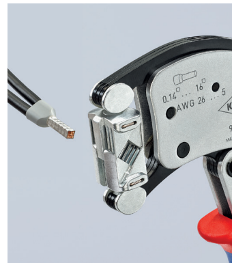
Twin end sleeves (ferrules) up to 2 x 10 AWG (2 x 6 mm 2 ) can be crimped without adjustment