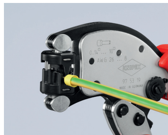
Uniquely flexible: connectors can be inserted in the rotatable crimp head from almost any position