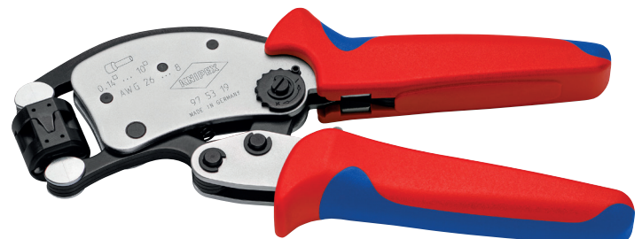
97 53 19