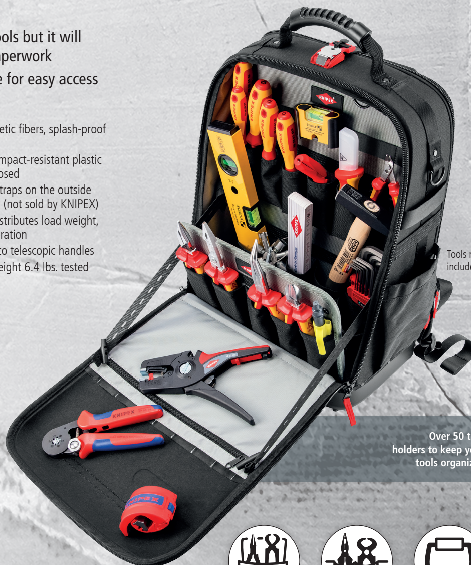
Tools not included

Over 50 tool holders to keep your tools organized