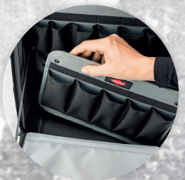
Removable, half-height tool panel