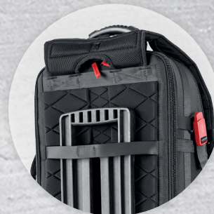
The luggage strap allows convenient attachment to telescopic handles