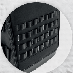
Carabiners or adapters can be attached to the MOLLE straps and combined in almost any way (not sold by KNIPEX)