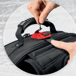
Patented magnetic FIDLOCK® connectors evenly distributes load weight