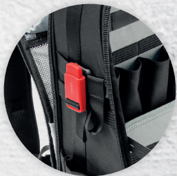
FIDLOCK® adapter with fabric loop