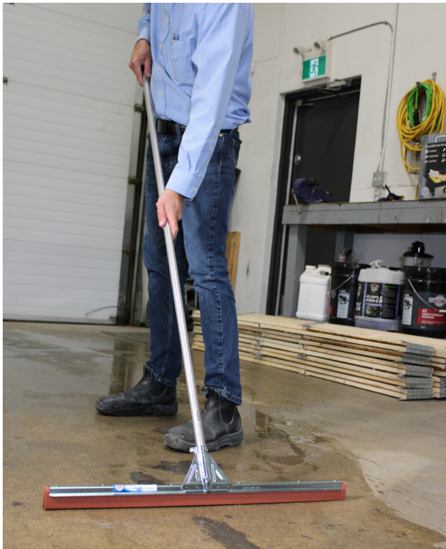
Bruske 30" Black Sponge Floor Squeegee

Bruske squeegees feature heavy duty galvanized steel construction, twin sponge rubber blades, and a highly efficient splash guard with reinforced handle socket to make liquid cleanup on floors safe and easy.