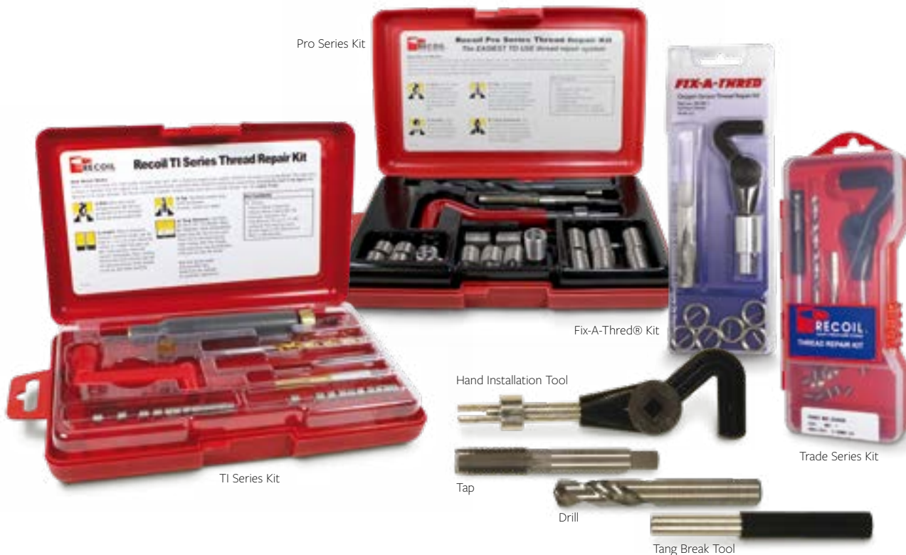
Pro Series Kit

Fix-A-Thred® designed for automotive and other simple equipment repair. Includes carbon steel tap, installation tool, and various lengths of inserts (6 - 12 inserts for each kit, depending on size). A PlugSaver® kit, containing 3 solid inserts, and an Oxygen Sensor kit, are also available.