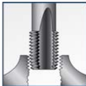
2 Tap the hole