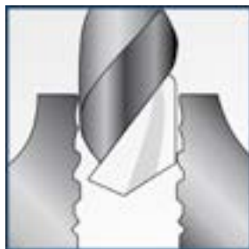
1 Drill the hole