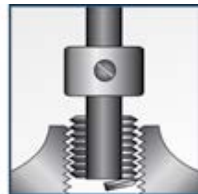
4 Break the Tang